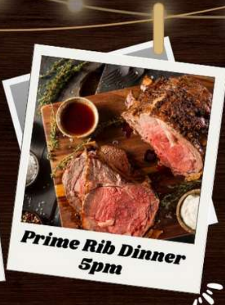
Prime Rib Dinner 5pm