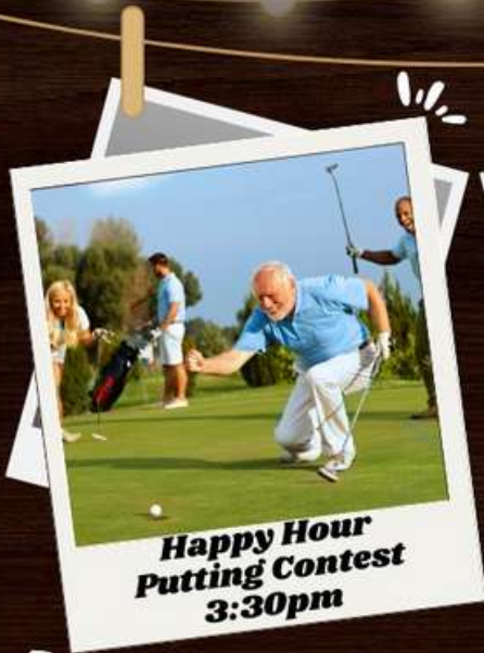
Happy Hour Putting Contest 3:30pm