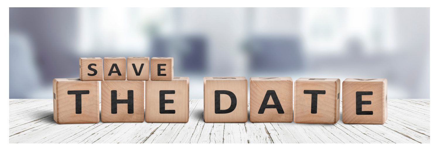
Grapes & Grains followed by Dinner & Entertainment November 3rd