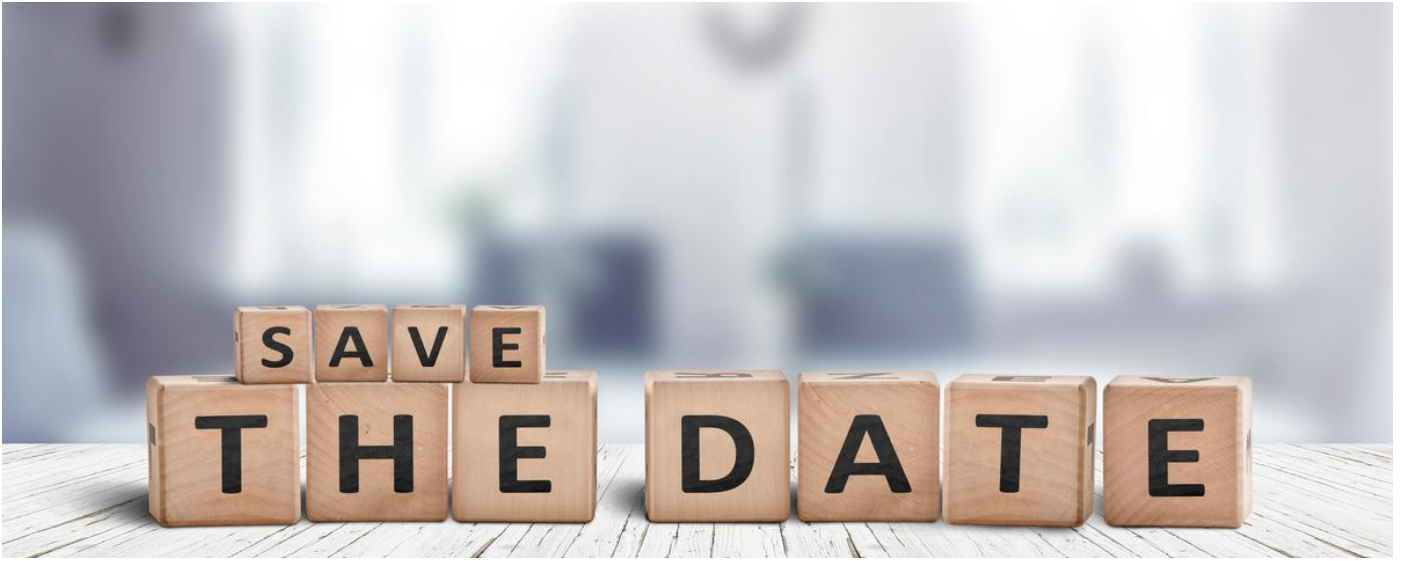
March 3rd -Wine Pairing